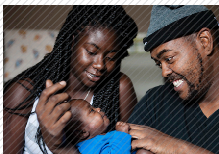
1990 Memphis, TN 1,138 Low-income blacks Urban area