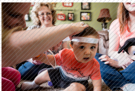
1977 Elmira, NY 400 Low-income whites Semi-rural area