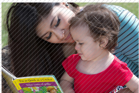
1994 Denver, CO 735 Large proportion of Hispanics Nurses and paraprofessionals

comparing the short- and long-term outcomes of mothers and children enrolled in the Nurse-Family Partnership program to those of a control group of mothers and children not participating in the program.